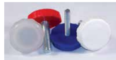
Many colors available as custom option.