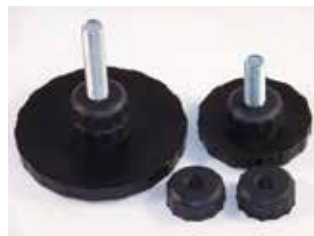
* Patent Pending