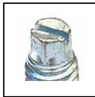
Top Hex (-HX) and Slot (-SL)